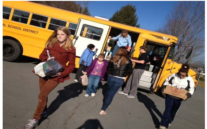
Students deliver food to the JCEO food pantry

drive to benefit the Peru food pantry and the American Red Cross for victims of Superstorm Sandy. On Monday November 19 th , Peru delivered over 1,000 food items to the JCEO in Treadwell Mills and collected generous donations from the coin drive district wide.