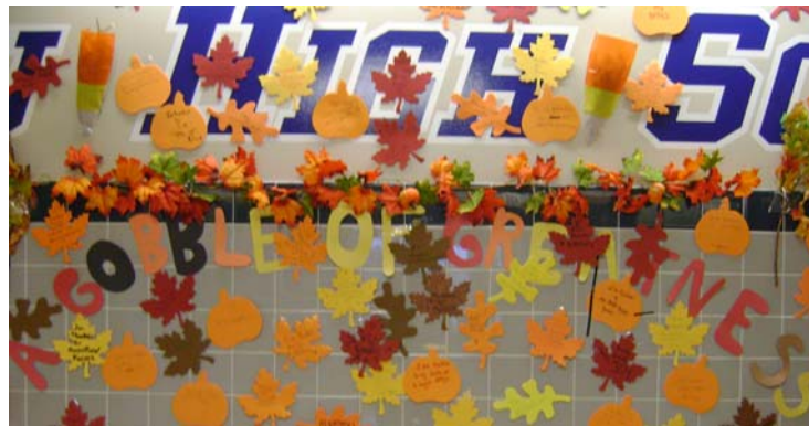
PSET decorated the lobby with November themes of greatness and thanks